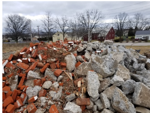
The Hickory Grove One-room School, above and now recently demolished.

This latest school stood at the corner of Limekiln Road and Spanglers' Mill Road and had been used as a field office by Hempt Brothers Farms for more than thirty years. A few years ago, the Hempt Brothers sold their entire operation to a business from the Mid-west and the new owners started selling off the farms. This one has been sold for luxury condominiums.